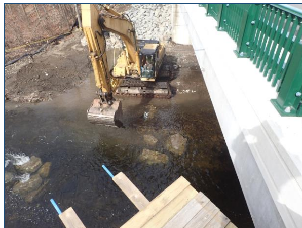
Installation of Perry Avenue boulder clusters.

Staff provided guidance on the installation of boulder clusters both upstream and downstream of the new Perry Avenue Bridge over the Norwalk River in Norwalk. The boulders will function as fish habitat structures in the newly reconstructed stream channel.