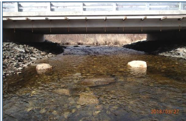
View of Walnut Street crossing in Essex over the Falls River. The four perched corrugated metal culverts (left photo) were replaced with a clear span bridge (right photo).

Staff provided guidance on the installation of boulder clusters both upstream and downstream of the new Perry Avenue Bridge over the Norwalk River in Norwalk. The boulders will function as fish habitat structures in the newly reconstructed stream channel.